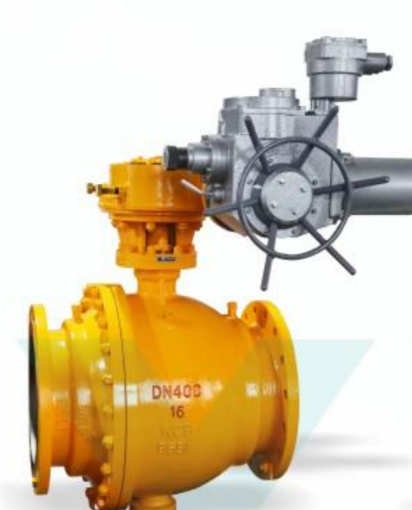
电动固定式法兰球阀 Electric fixed flange ball valve