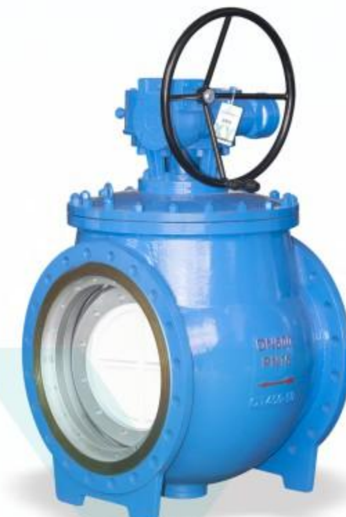
偏心半球阀 Eccentric hemispherical valve