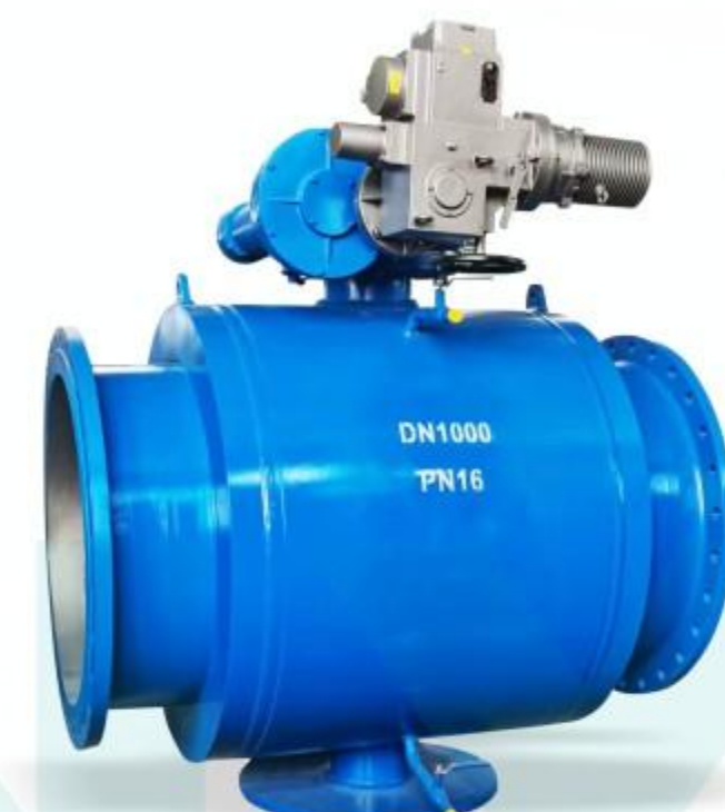
电动法兰全焊接球阀 Electric flange fully welded ball valve