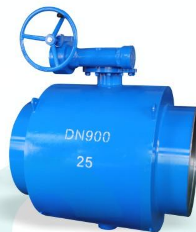
蜗轮全焊接球阀 Worm gear fully welded ball valve