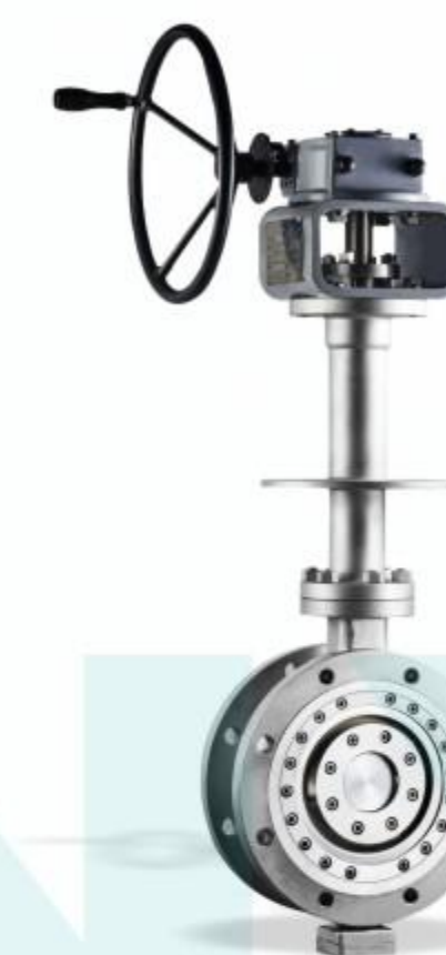
硬碰硬低温蝶阀 Hard hitting low-temperature butterfly valve