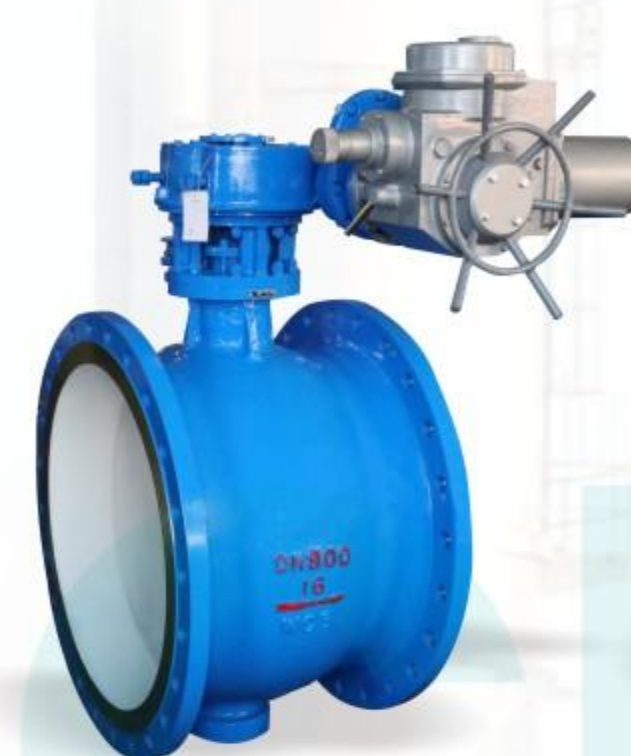
电动偏心半球阀 Electric eccentric hemispherical valve