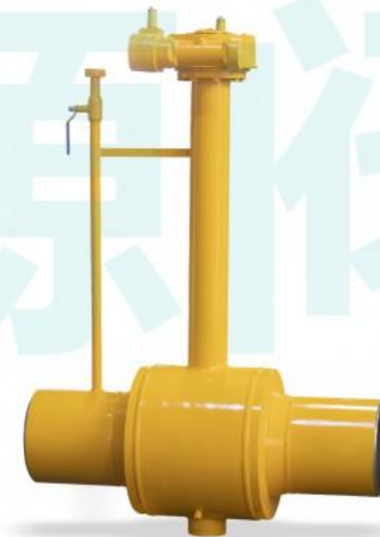
管线全焊接球阀 Pipeline fully welded ball valve