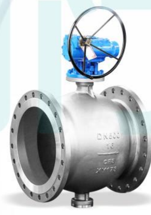
不锈钢偏心半球阀 Stainless steel eccentric hemispherical valve