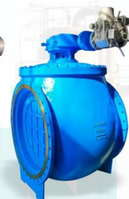
电动上装式偏心半球阀 Electric upper mounted eccentric hemispherical valve