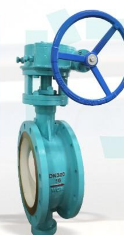
旋球阀 Rotary ball valve