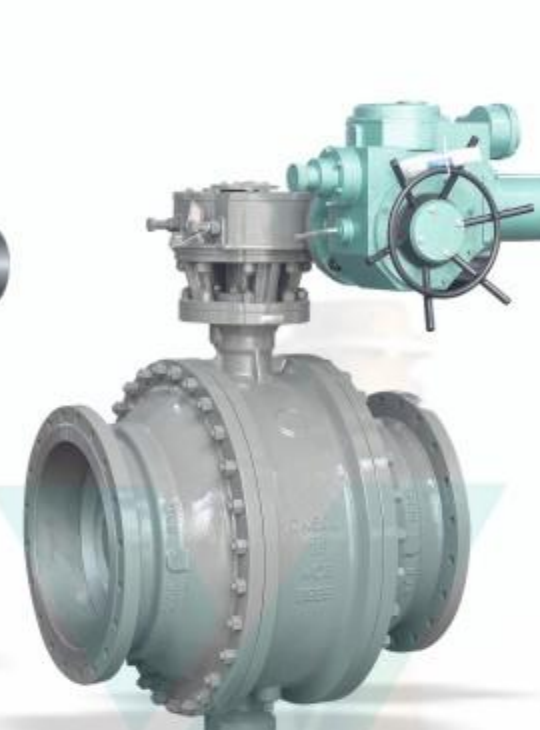
电动三片式固定球阀 Electric three piece fixed ball valve