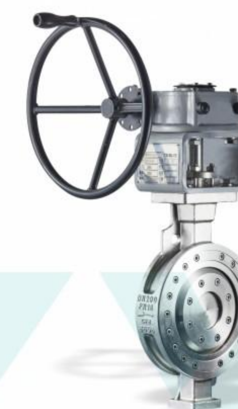
硬碰硬对夹蝶阀 Hard hitting butterfly valve