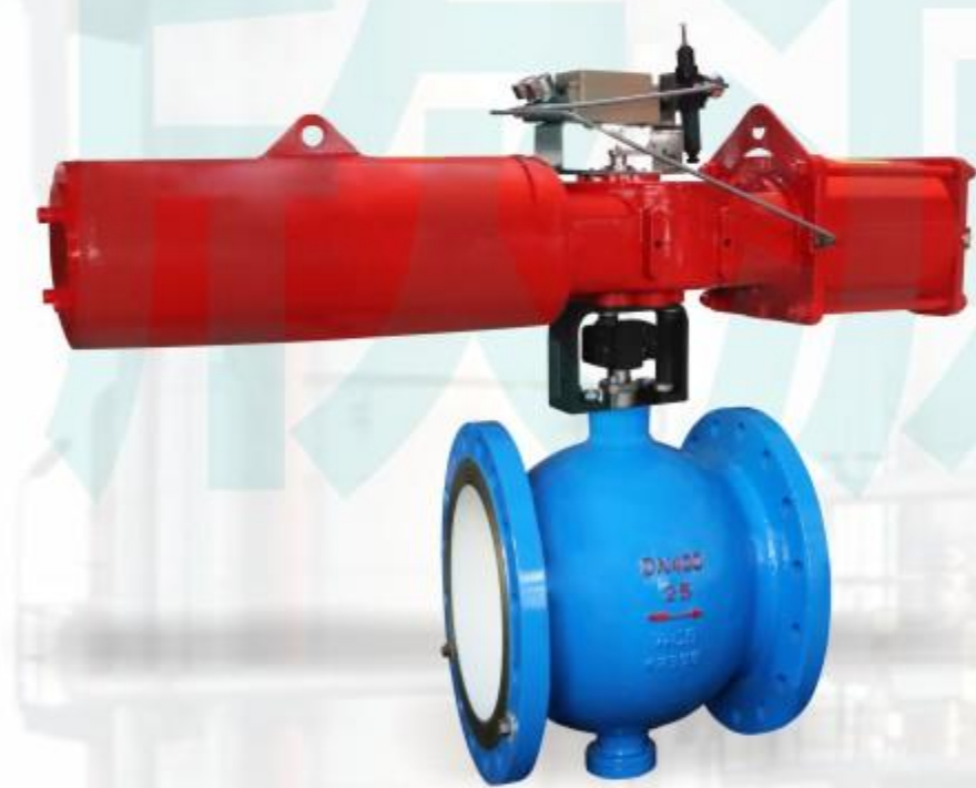
气动偏心半球阀 Pneumatic eccentric hemispherical valve