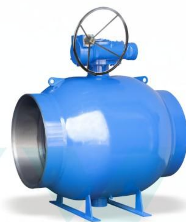
全焊接球阀 Fully welded ball valve