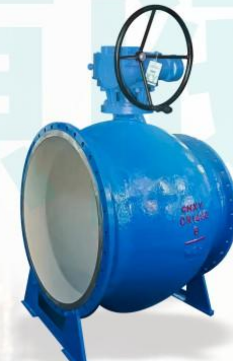
大口径蜗轮偏心半球阀 Top mounted eccentric hemispherical valve