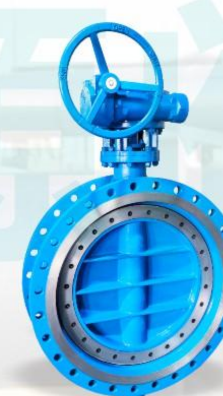
蜗轮法兰蝶阀 Worm gear flange butterfly valve