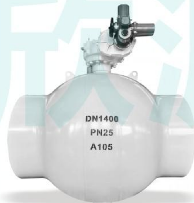
电动全焊接球阀 Electric fully welded ball valve