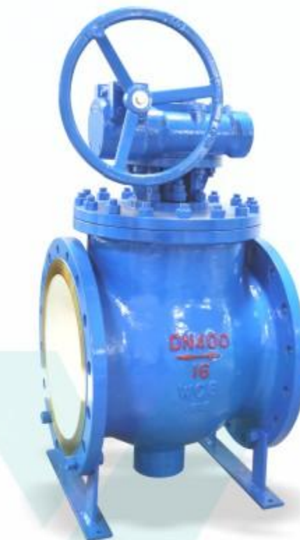
上装式偏心半球阀 Top mounted eccentric hemispherical valve