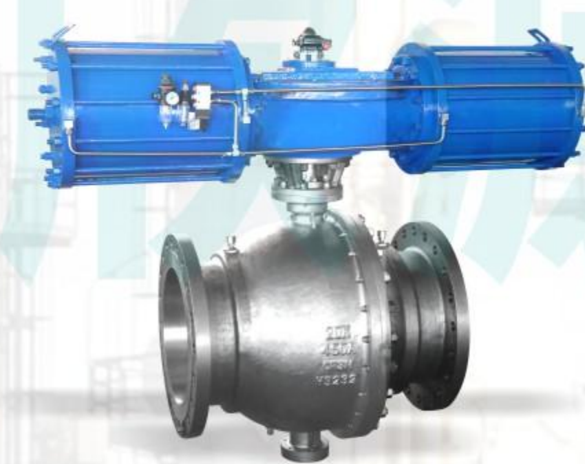
气动固定式法兰球阀 Pneumatic fixed flange ball valve