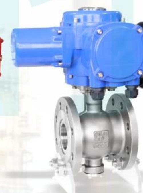
电动V型法兰球阀 Electric V-type flange ball valve