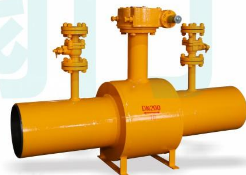
管线全焊接球阀 Pipeline fully welded ball valve