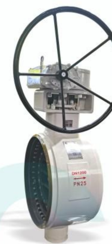
硬碰硬蝶阀 Hard hitting butterfly valve