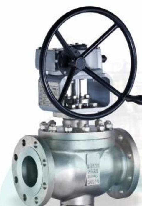
C型球阀 C-type ball valve