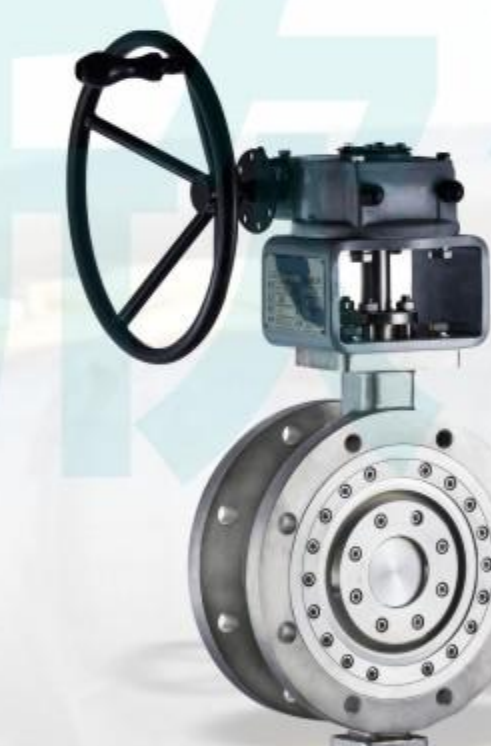
硬碰硬法兰蝶阀 Hard hitting flange butterfly valve