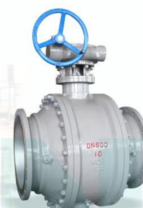
蜗轮固定式法兰球阀 Worm fixed flange ball valve